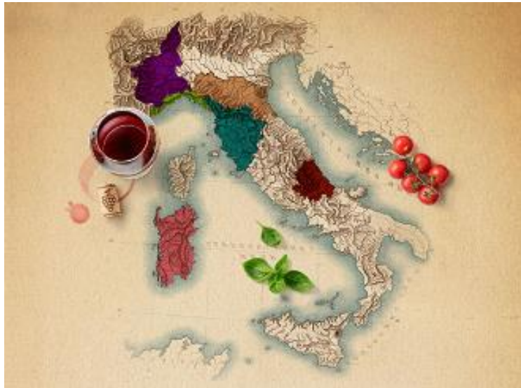
Savour authentic Italian regional cuisine at Nostra Cucina

Embark on an epicurean journey across Italy with Nostra Cucina's Italian Regional Series . Each month, the restaurant offers special produce paired with wine styles that are unique to a particular region of Italy. In February, explore the rich culinary heritage of Liguria, a coastal region of north-western Italy, and taste iconic dishes such as Ligurian pizza (S$27++) and Pesto Corzetti alla Genovese (S$27++).