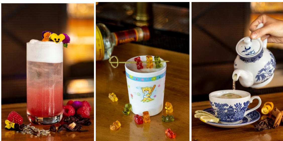
Bread Street Kitchen presents an array of handcrafted cocktails (from L to R): Les Fleurs Du Bien , Gummy One Pisco , and 5 o'clock

Bread Street Kitchen has launched a fun cocktail guide titled Our Signature Compass . Featuring 10 new handcrafted cocktails, the menu illustrates varying levels of sweetness and richness of each tittle, serving as a perfect guide for the adventurous. New tipples include the 5 o'clock (S$22++) inspired by the classic rum punch which was featured in Gordon Ramsay's cook book. The whiskey-based tittle comprises English breakfast tea, clarified milk, lemon and spices. Other interesting creations include the Gummy One Pisco (S$22++), a whimsical spin on the classic Peruvian cocktail served in an adorable kid's cup, featuring pisco-infused gummy bears that bring back fond childhood memories. Those who prefer something lighter on the palate can opt for The Le Fleurs Du Bien (S$22++), a floral raspberry-infused vodka cocktail inspired by the British musical My Fair Lady .